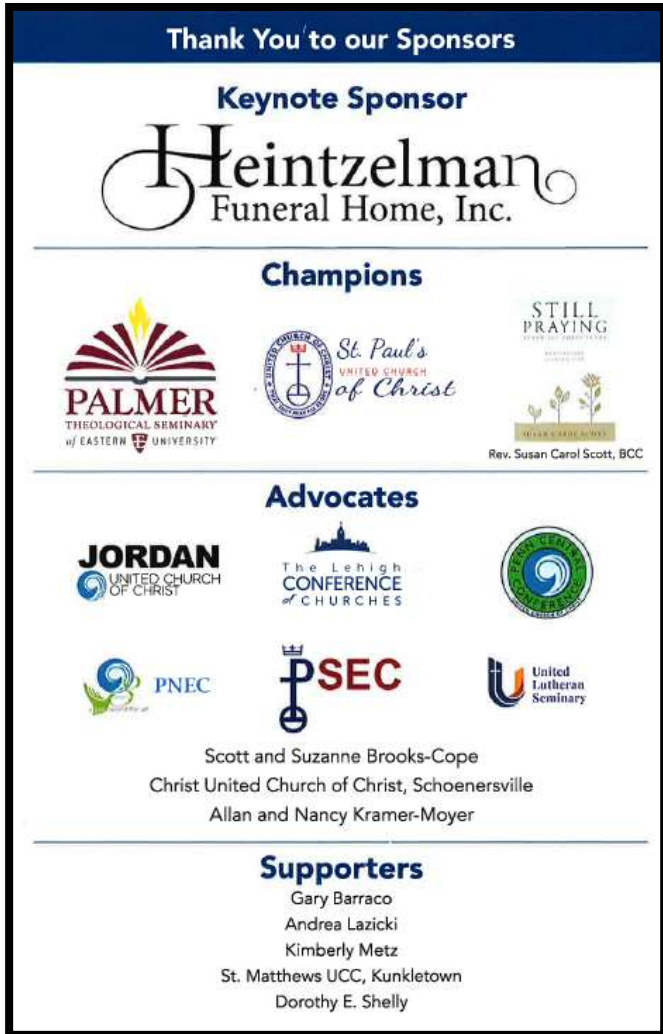
Pictured: Phoebe CPE Program sponsorship