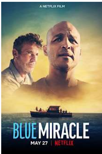
An unlikely team works together to save an orphanage.

We will be watching Blue Miracle (PG, approx 95 minutes)